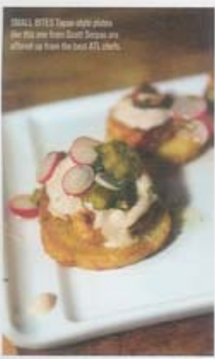
SMALL BITES These slider photos are the size of your thumb, but they're as big as the best ATL chefs.

1 FEED YOUR SOUL Duck sliders, mieng kum and Kenny Rogers have all been on the menu before. This year, a Yankee comes to town on April 14 . NYC restaurateur Danny Meyer hosts the can't-miss Share our Strength's Taste of the Nation to raise funds for its No Kid Hungry Campaign. taste.strength.org