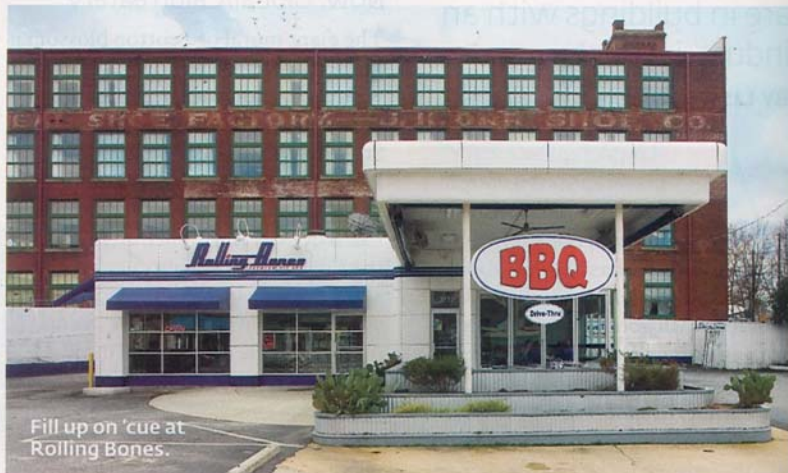
Fill up on 'cue at Rolling Bones.

Recycling a gas station worked for Watershed in Decatur, so there's no reason others can't pump up the energy. Rolling Bones Premium Pit BBQ serves traditional barbecue in a retro diner atmosphere. New chef and part owner Todd Richards (formerly at Four Seasons Hotel) has already put the eatery on a national list of best BBQ restaurants. Offerings include a pulled duck sandwich with fig relish and a half-slab of smoked pork ribs. 377 Edgewood Avenue; rollingbonesbbq.com