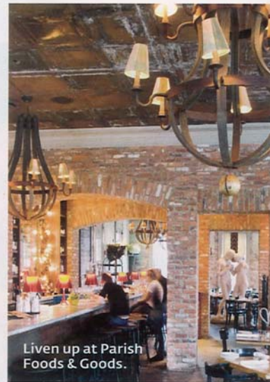
Liven up at Parish Foods & Goods.