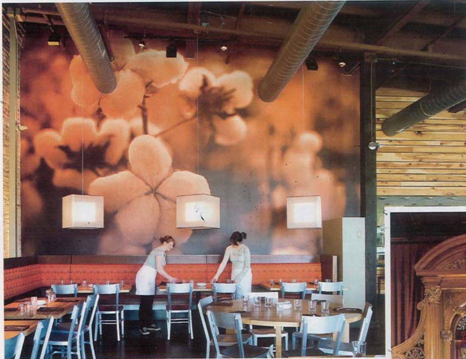
LEFT: Cotton blossom motif at Serpas